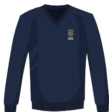
Jumper V-neck (Boys & Girls)