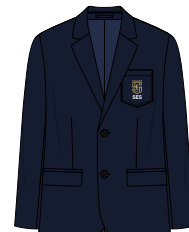
Blazer Jacket Optional on Order