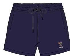
Swimming Trunks Primary Boys