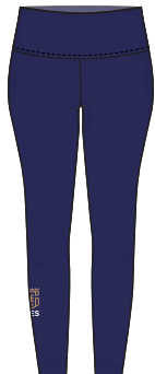
Leggings Optional for Girls