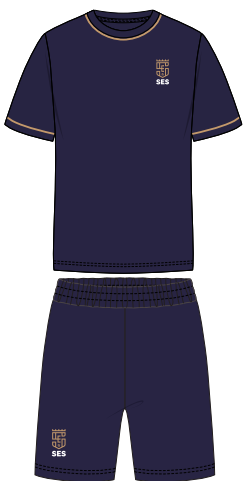
PE Kit Unisex