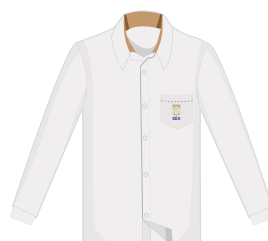
Long sleeves (Boys & Girls) Optional on Order