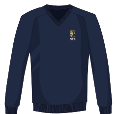
Jumper V-neck (Boys & Girls)