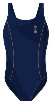
Swimming Suit Primary Girls