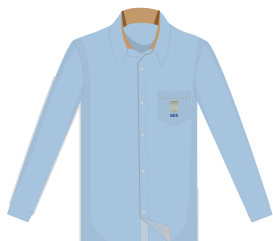
Long sleeves (Boys & Girls) Optional on Order